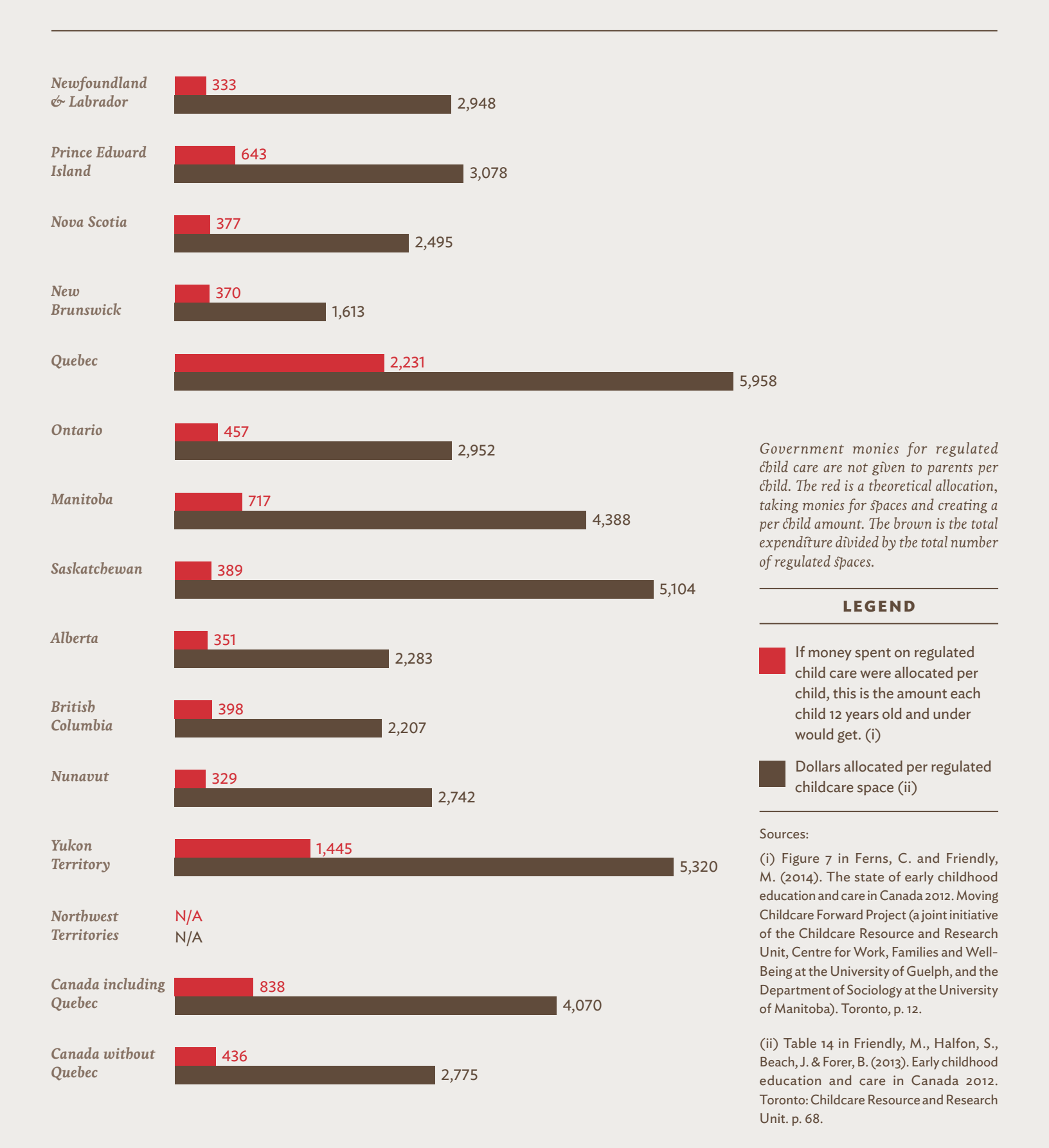
Figure 1. Government monies per child, contrasted with actual allocations per regulated childcare space by province/territory, 2011/2012